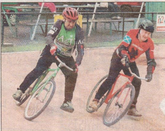
■ An A & T teamster takes the outside line at Gin Pit